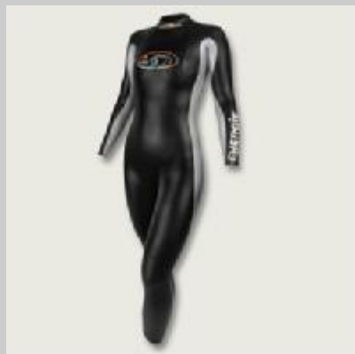
Pictured: A Men's Helix and a Woman's Energie wetsuit.

Support our Sponsor!: Ironmanwetsuits.com