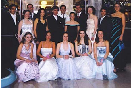
(A group of team members at last Fall's Prom Show)

If you have any ideas or questions about volunteering or fundraising or want to sign up, contact Chelsey Green at chesleygreen@wisc.edu .