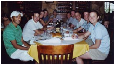
(The team eating at the Macaroni Grill in Memphis)