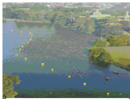
UK's inaugural Ironman S-shaped swim course

castle next to it was built (18 th century) and the bottom was mucky with sticks and rocks everywhere. The water was so dirty I couldn't see my hand after submerging it about two inches into the water—no kidding! Wingra looks like the Caribbean now...There was a small town similar to Verona—a ton of hard screaming fans! I finished the bike shortly there after and was glad for it...! There was lots of encouragement out on the course with great volunteers and some nice spectators. A few “well done Wisconsin” “well done Wisconsin Badgers” were shouted to me...All-in-all it was a decent race: