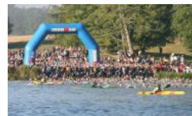
UK's inaugural Ironman

1:17:47 Swim; 6:48:39 bike, 4:12:06 run-12:36:29 total. I finished 470/1227 and 112/314 in my age-group. I was a whole seven minutes faster than Ironman WI 2003 and felt better physically instead of being sore for a few days...It was really exciting and fun to do, but I think we really have the best Ironman race right here in our own backyard.